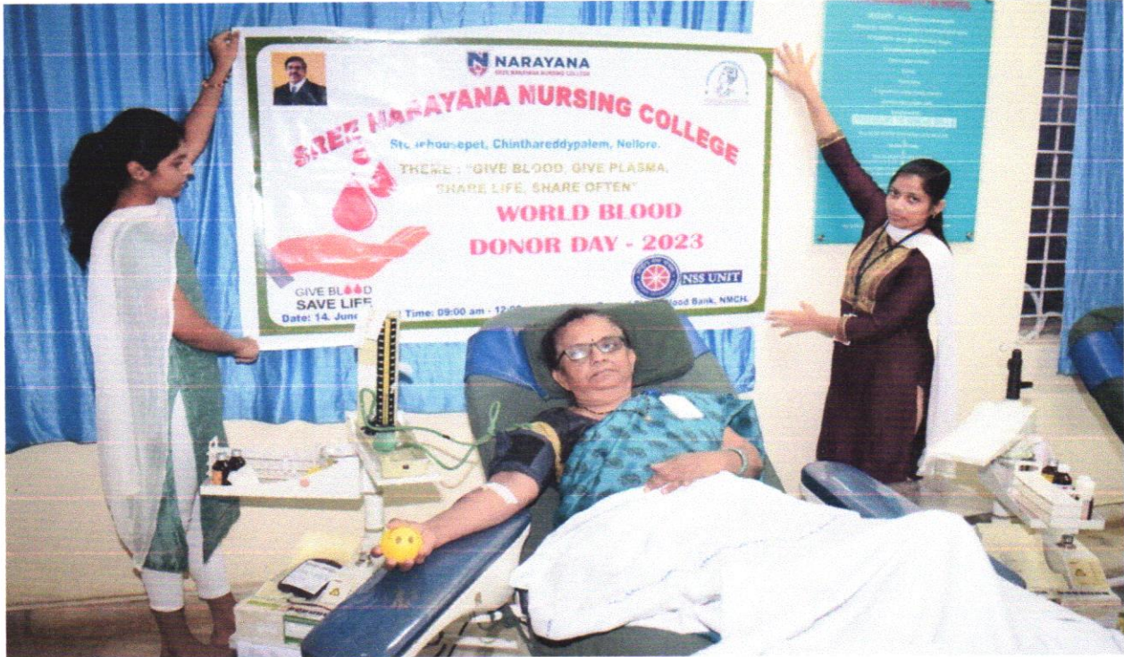
Faculty donating the blood

Affiliated to NTR University of Health Sciences, A.P. Vijayawada.